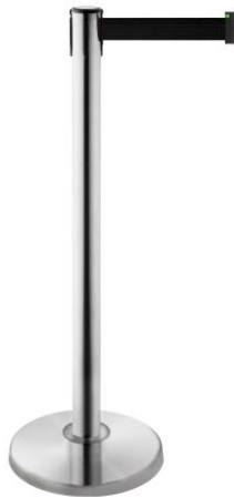
Abb. 1: ALA-100-3,0-30