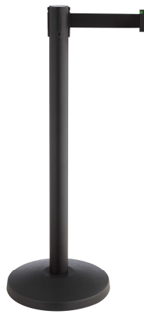
Pict. 2: ALA-10-3,0