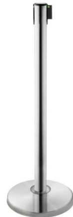
Abb. 1: ALA-100-3,0-10