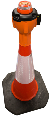
Pict. 1: ALCT-FL = light on cone topper ALCT-O (cone and cone-topper not included)